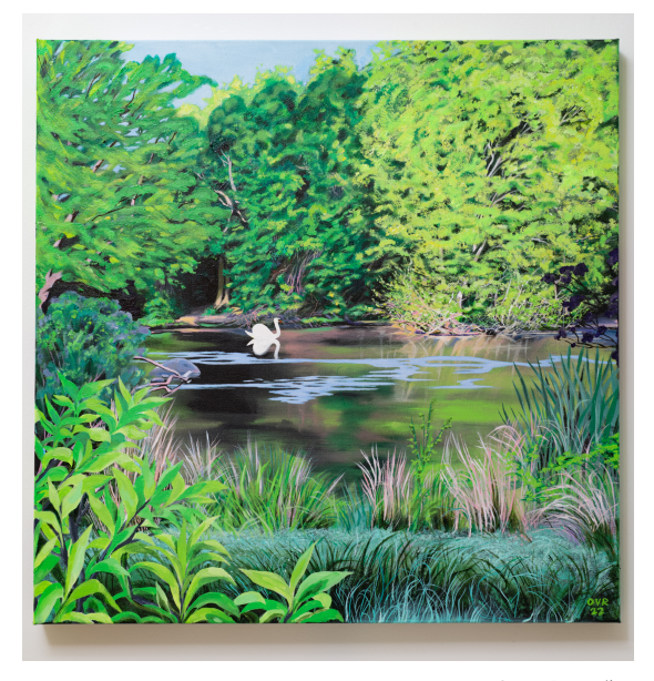
Ona Rygelis Swan in Prospect Park Acrylic Paint on Canvas, 2022